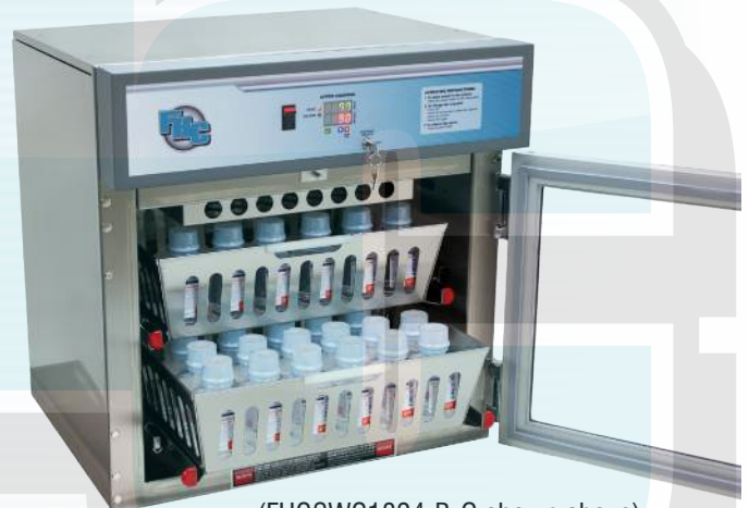
(FHCSWC1824-B-G shown above)

(If ordered w/ warmer add -B to model #)