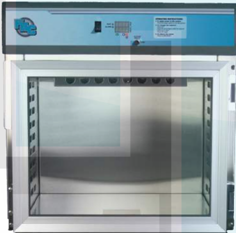
(FHCSWC1824-G shown above)

120v, 3.5 amp., 50/60Hz .39 kw/hr, 1332 btu/hr UL/CUL listed FDA registered