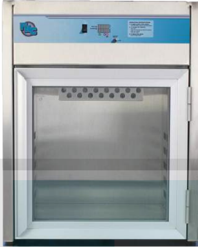
(FHCSWC1518-G-TL shown above)