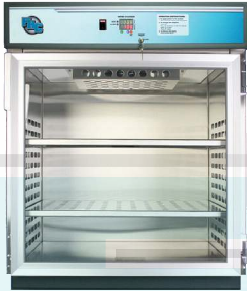
(FHCSWC36-G shown above)