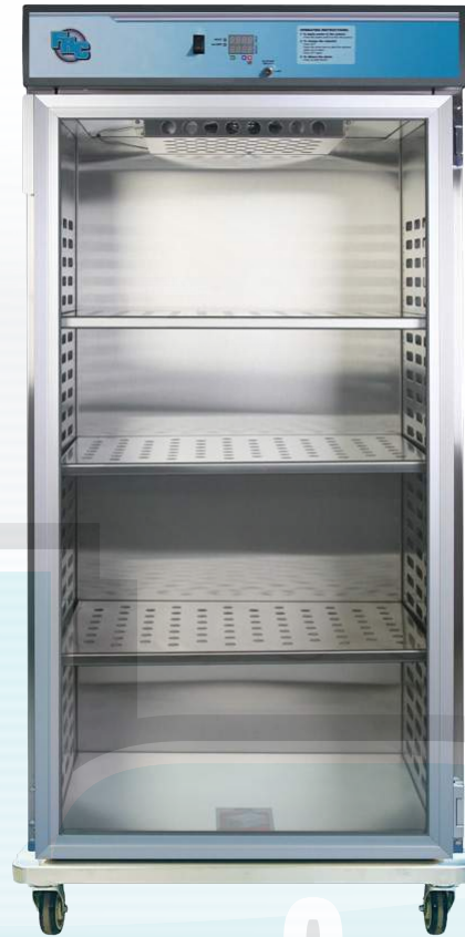
(FHCSWC60-G shown above w/ optional mobile base)

120v, 7.5 amp., 50/60Hz .49 kw/hr, 1678 btu/hr UL/CUL listed FDA registered