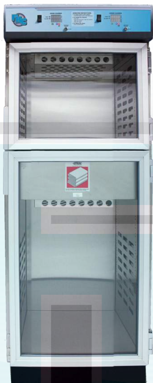
(FHCDWC2460-G shown above)