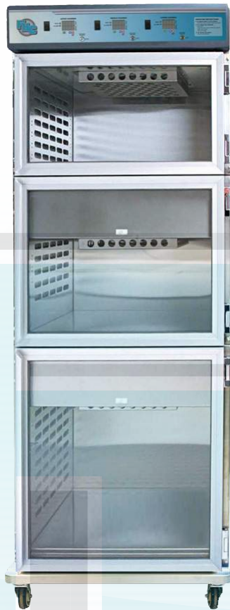
(FHCTWC24-G shown above w/ optional mobile base)