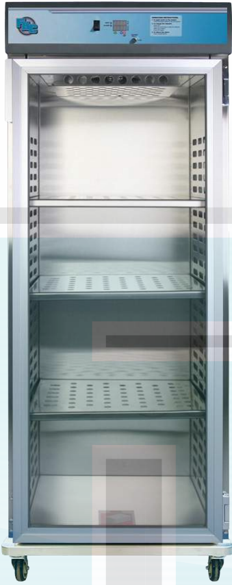
(FHCSWC2460-G shown above w/ optional mobile base)