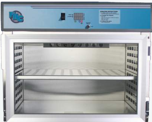
(FHCSWC24-G shown above)

120v, 3.5 amp., 50/60Hz .45 kw/hr, 1537 btu/hr UL/CUL listed FDA registered