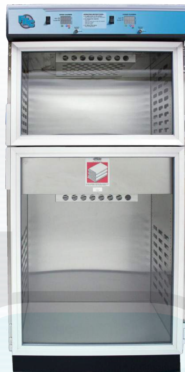
(FHCDWC60-G shown above)

120v, 12 amp., 50/60Hz .69 kw/hr, 2356 btu/hr UL/CUL listed FDA registered