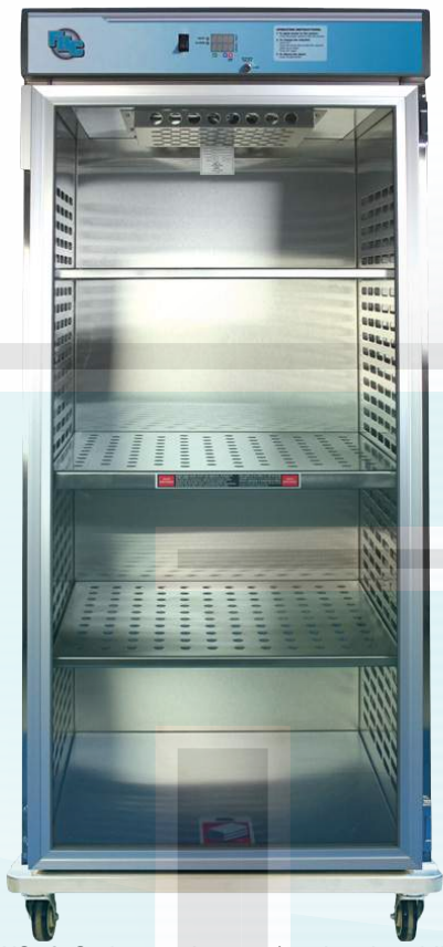
(FHCSWC72-G shown above w/ optional mobile base)