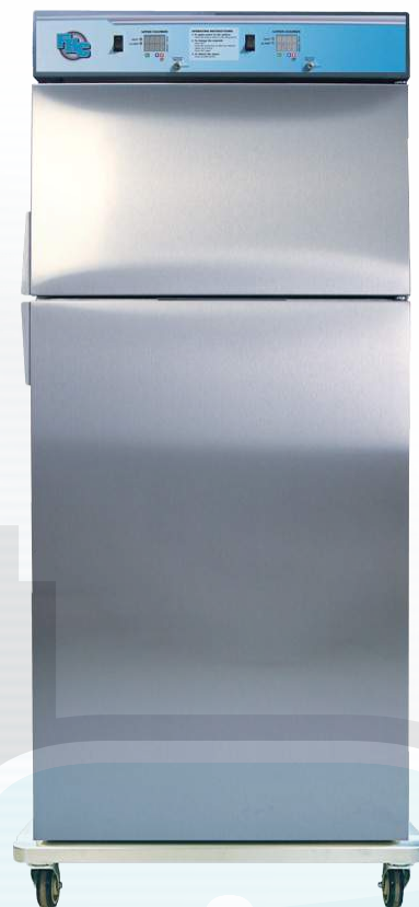
(FHCDWC24 shown above w/ optional mobile base)

120v, 10 amp., 50/60Hz .49 kw/hr, 1678 btu/hr UL/CUL listed FDA registered