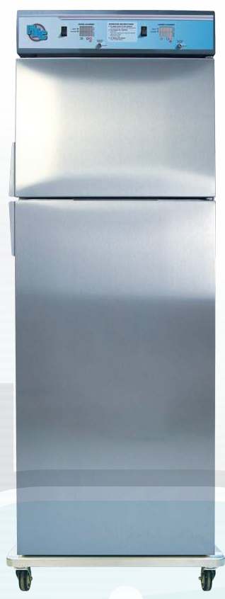
(FHCDWC2424 shown above w/ optional mobile base)

120v, 7.5 amp., 50/60Hz .53 kw/hr, 1810 btu/hr UL/CUL listed FDA registered