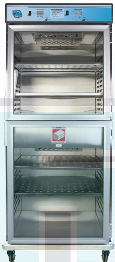
(FHCDWC36-G shown above w/ optional mobile base)