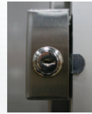
Optional door lock