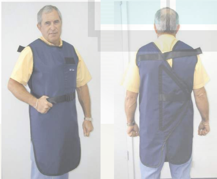
THE BACK CLOSE WRAP JACKET

The BACK CLOSE WRAP is our lightest full protection jacket. As an improvement, this style has a strap across the shoulders to hold them in place. For a more secure fit, we added front buckles. Shoulder pads and an embroidered pocket are also included.