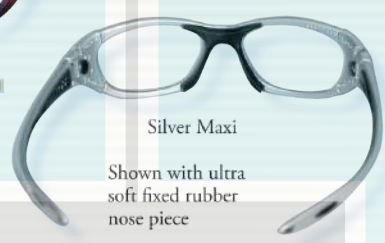
Silver Maxi PUMAX-100-S