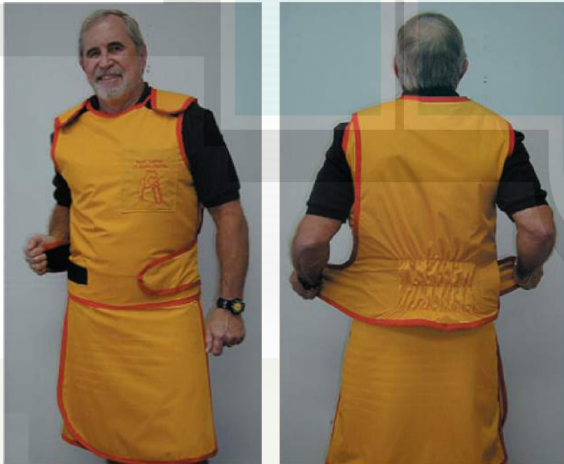
THE SLOT STRETCHY BACK APRON

While still getting full protection, the customer also receives our lightest vest. This design incorporates back lumbar support with elastic in the back. The SLOT STRETCHY BACK , allows the customer to adjust for maximum comfort. We include shoulder pads, pocket, and embroidery.