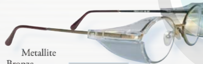
Metallite Bronze "For Smaller Faces" PU553S