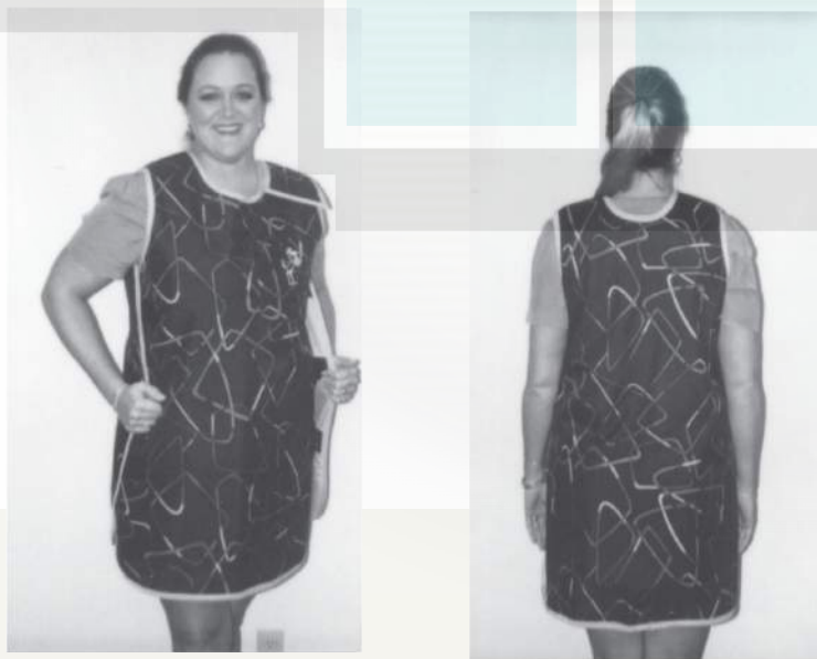
THE PONCHO APRON

The PONCHO APRON is an economical solution to the need for wrap-around protection. The one-sided Velcro closure allows greater flexibility in sizing. Front protection is .5mm Pb and the back is .25mm Pb equivalence. Sizing is unisex.