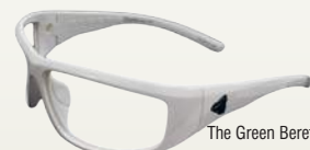
The Green Beret