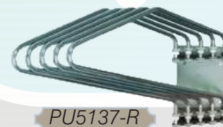
Five Arm Swing Rack