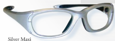
Silver Maxi PUMAX-100-S

Prescriptions: Single, Bifocal, Progressive Size: Slightly smaller than Pulse Lites Other: Ultra soft fixed rubber nose piece