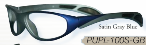
Satin Gray Blue PUPL-100S-GB