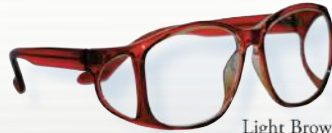
Light Brown PU53-LBWO