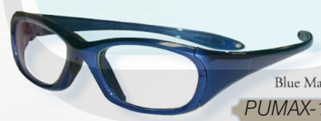
Blue Maxi PUMAX-100-BL