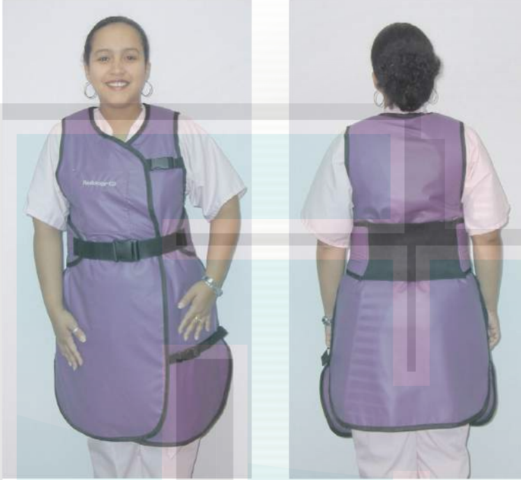
THE JACKET APRON

Our JACKET apron was designed for optimal protection. Your comfort is also a primary concern so a wide support belt and shoulder pads are standard. Each front panel is .5mm Pb. equiv. An embroidered pocket is also included.