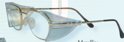
PU662S Metallite Standard 62 grams