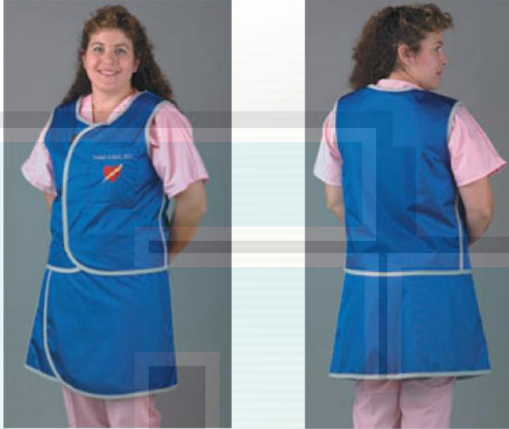
THE TWO PIECE APRON

When full protection becomes important, the TWO PIECE should be your choice. Two pieces add to your comfort through more efficient distribution of weight. Each front vest panel is .5mm Pb. equiv. The vest comes with shoulder pads, pocket, and embroidery. The skirt has hanging loops as well as attached belt to tighten the waist. For a smaller waist, we can sew elastic in the back of the skirt.