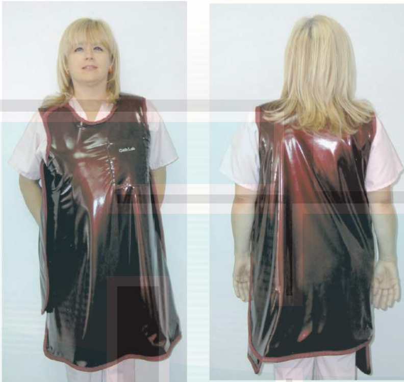
THE MATERNITY JACKET APRON

The front of the MATERNITY JACKET apron (.5mm Pb equiv.) is tapered for maximum adjustability as needed. We can include a specially designed half-apron to be worn under the full apron for double protection in the abdomen-pelvic cavity (1.0mm Pb total equivalence). The lead used is the lightest currently available. Also available in front protection only.