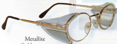
Metallite Gold "For Smaller Faces" PU557S

80 grams .75mmPb front .35mmPb side All scripts Adjustable frame