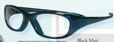
Black Maxi PUMAX-100-BK

Weight: 63 grams Lead Equiv. Front: .75mmPb Lead Equiv. Side Shields: .35mmPb (optional add "-S" after 100)