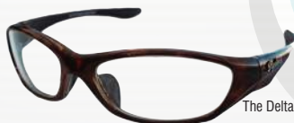
The Delta Force