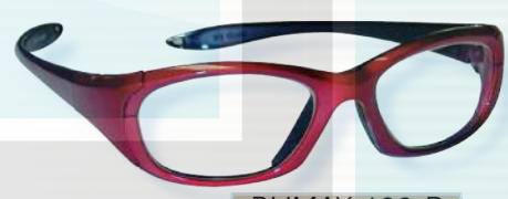
Crimson Maxi PUMAX-100-R